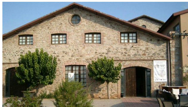
The exhibition hall

The town of Lavriion is situated 67 kilometers south east of Athens city centre. It is an old and forgotten port, very close to Cape Sounion at the tip of Attica peninsula, where the ancient Temple of Poseidon is overlooking the Aegean Sea for centuries. Its people love the place they live in. They show the same respect to the 2500 years ancient temple as well as to a 100 years ship loading platform, their precious “échelle”, which they nowadays try to fund its restoration project.