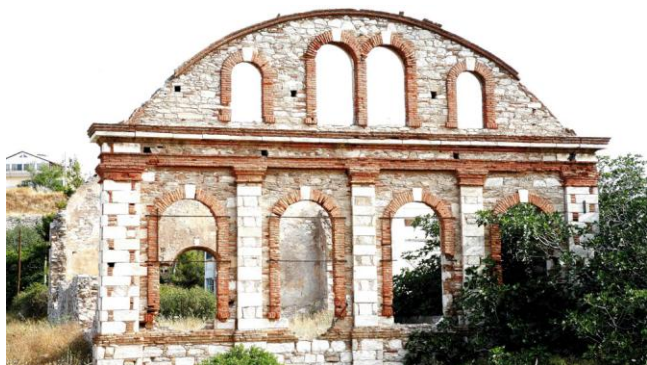
The façade of the metal-wash building, currently Under restoration, which inspired the exhibition logo.

Our non-philatelic part-ners, the Scientific Association of Lavriion ( www.emel.gr ), had suggested running the event at home (used to be called Laurium in English). The place was known as far back as the antiquity, because of its active silver mines during the Golden Age of Pericle’s Athens. The exhibition would be accommodated in a recently renovated industrial building, part of what today is the “Lavriion Technological and Cultural Park” ( www.ltp.ntua.gr ) and of what once upon a time was the “Compagnie Française des Mines du Laurium”. It is twenty years now, that the National Technical University of Athens is not only restoring the old buildings of the French mining company, it is also reviving a contaminated environment.